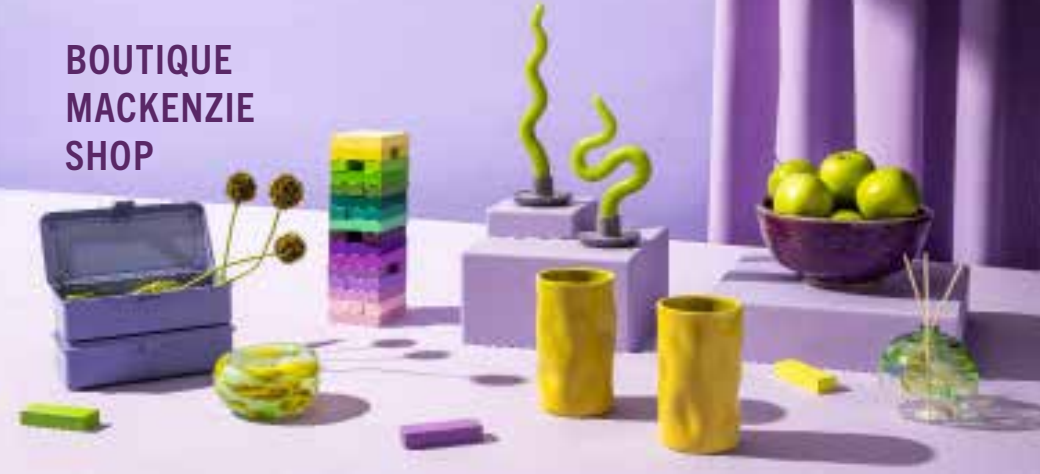
Samples of products from the Boutique MacKenzie Shop