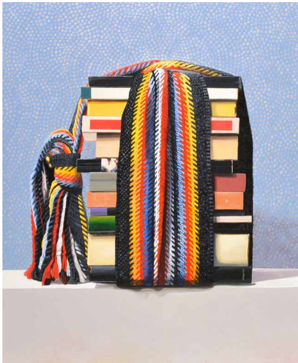
Image: David Garneau (Métis, Canadian, born 1962), Métis Bundle II , 2022, acrylic on canvas. Collection of the MacKenzie Art Gallery