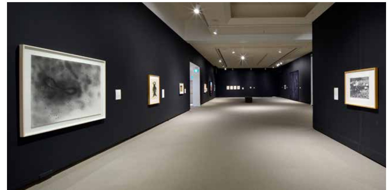
Image: Installation view of The Permanent Collection: What the Bat Knows, 2022, MacKenzie Art Gallery.