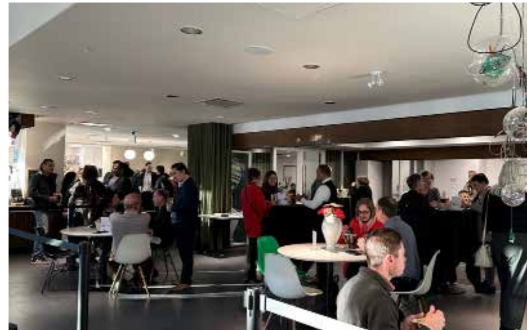
Images (Top, Left to Right): Visitors engage during a vault tour at the MacKenzie Art Gallery, 2023. Visitors engage during an exhibition tour of Ten Artists of Saskatchewan: 1955 Revisited , 2022, MacKenzie Art Gallery. Visitors engage during a member event at the MacKenzie Art Gallery.