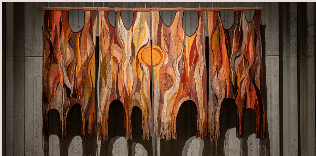
Prairie Interlace: Weaving, Modernisms and the Expanded Frame, 1960-2000 (installation view), Nickle Galleries.

Cost: $150 for up to 50 students. $175 for up to 75 students. Please bring at least one adult supervisor per 25 students.