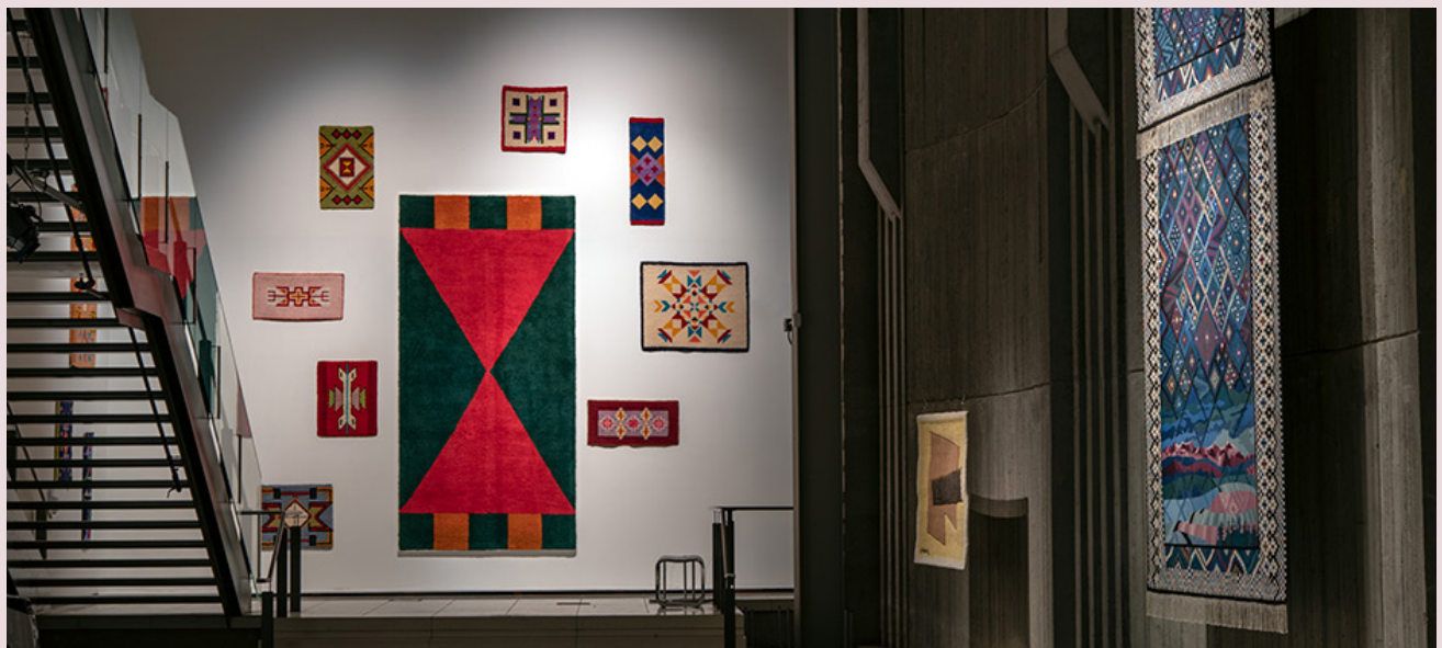
Prairie Interlace: Weaving, Modernisms and the Expanded Frame, 1960-2000 (installation view), Nickle Galleries.

In the studio, we will be creating abstract wall hangings using mixed fibre mediums and techniques. Students can choose from and combine techniques such as tassel making, braiding, crochet, and macramé. This project can be scaled to meet the needs of each touring group.