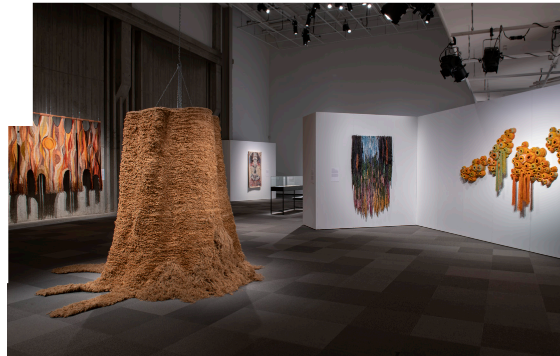
Images: Installation views of Prairie Interlace: Weaving, Modernisms, and the Expanded Frame, 1960–2000 , Nickle Galleries.