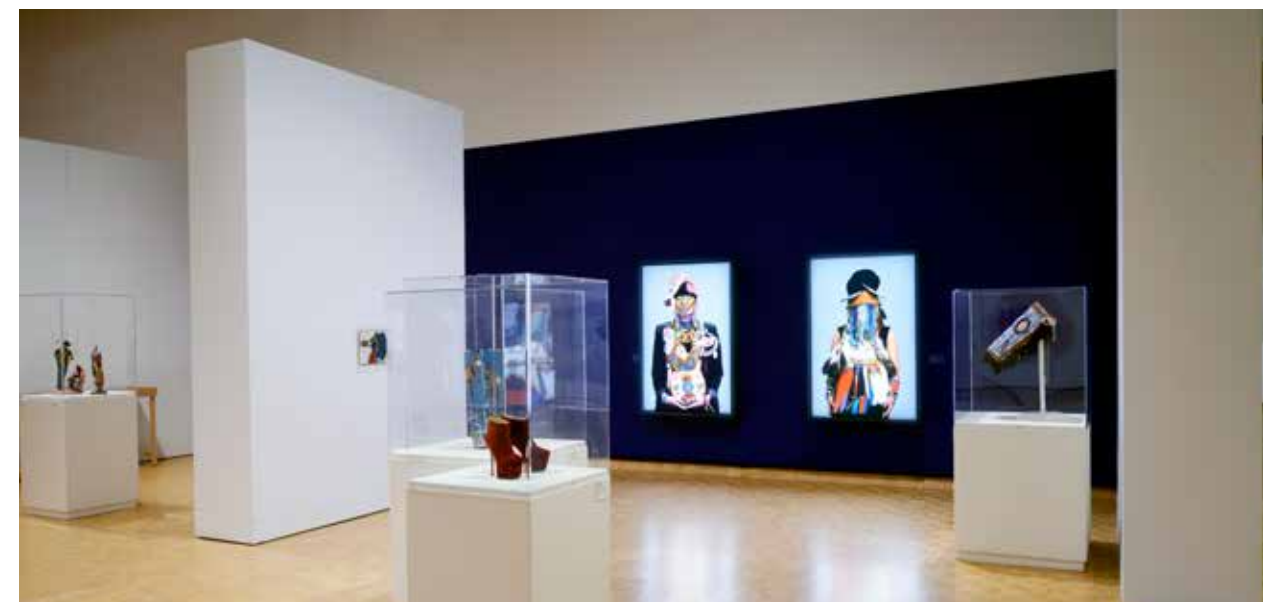
Images: Installation view of Radical Stitch , 2022, MacKenzie Art Gallery.