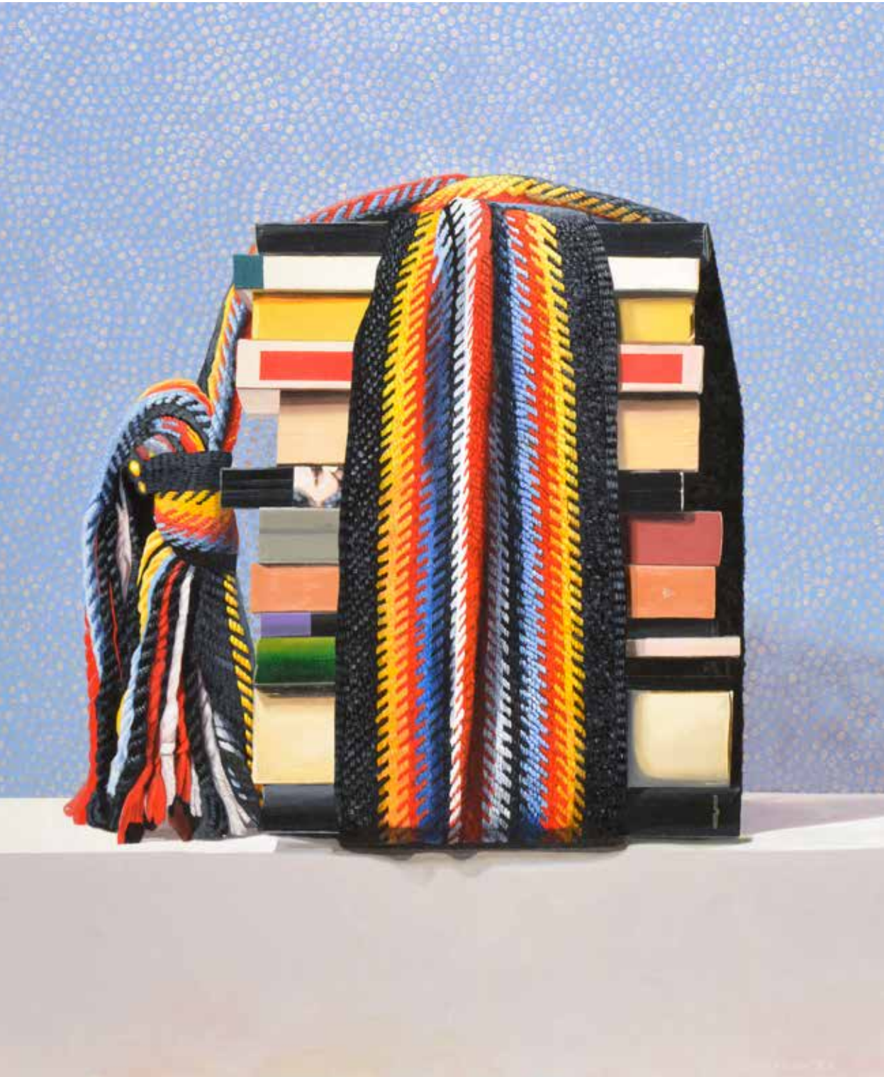
Image: David Garneau (Métis, Canadian, born 1962), Métis Bundle II , 2022, acrylic on canvas. Collection of the MacKenzie Art Gallery