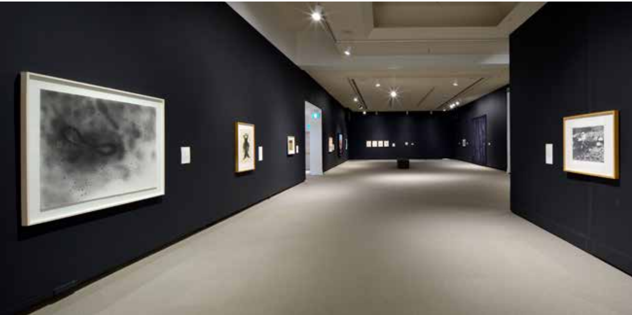
Image: Installation view of The Permanent Collection: What the Bat Knows, 2022, MacKenzie Art Gallery.