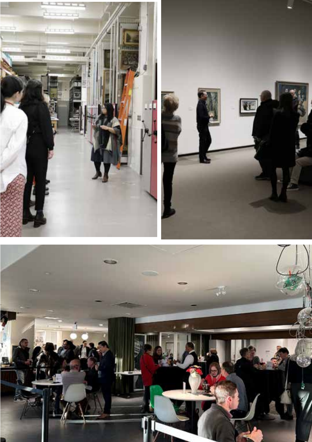
Images (Top, Left to Right): Visitors engage during a vault tour at the MacKenzie Art Gallery, 2023. Visitors engage during an exhibition tour of Ten Artists of Saskatchewan: 1955 Revisited , 2022, MacKenzie Art Gallery. Visitors engage during a member event at the MacKenzie Art Gallery.