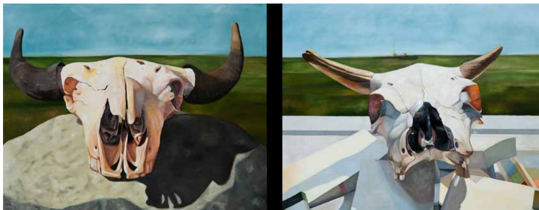
Above: Sherry Farrell Racette, Apparition: October 3, 1885, 1992 , gouache on card, 78.60 x 35.50 cm. Collection of the MacKenzie Art Gallery, purchased with the financial support of the Canada Council for the Arts Acquisition Assistance Program.