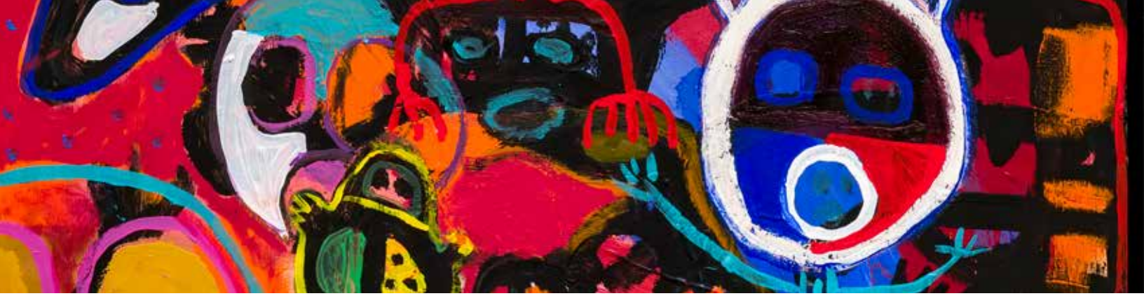
Jane Ash Poitras, Screaming Shaman series (detail), 1994, oil, mixed media. The Mendel Art Gallery Collection at Remai Modern. Purchased with support from the Canada Council's Acquisition Assistance Program, 1996.