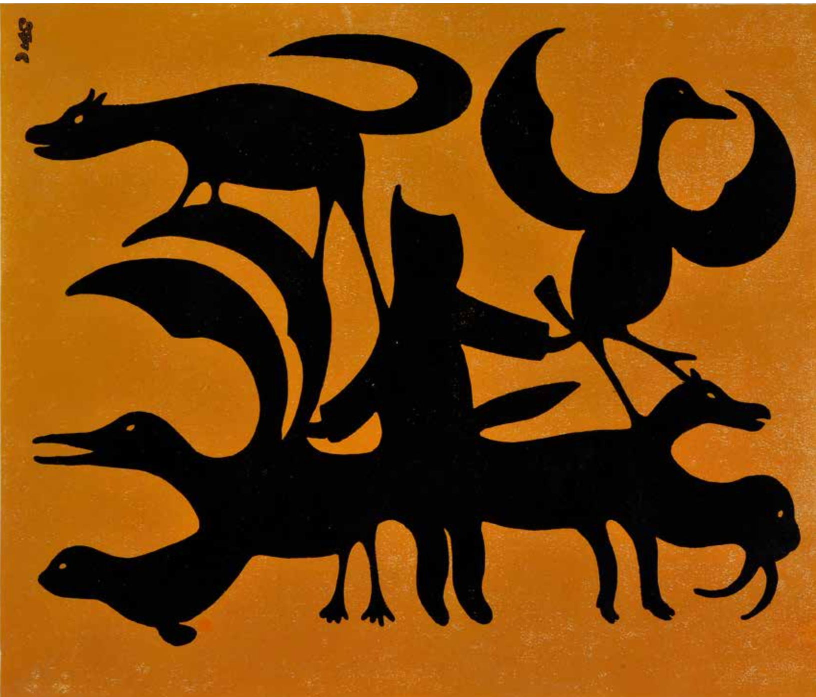
Kenojuak Ashevak, Vision in Autumn , 1960, stoneblock print on paper, edition 17/50, 40.5 x 48 cm. Collection of the MacKenzie Art Gallery, gift of the Estate of Jeanie Wagner.